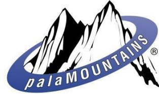
Table Flat Trekking